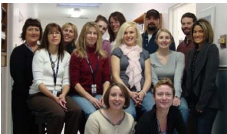
KITTITAS COUNTY PUBLIC HEALTH DEPARTMENT STAFF